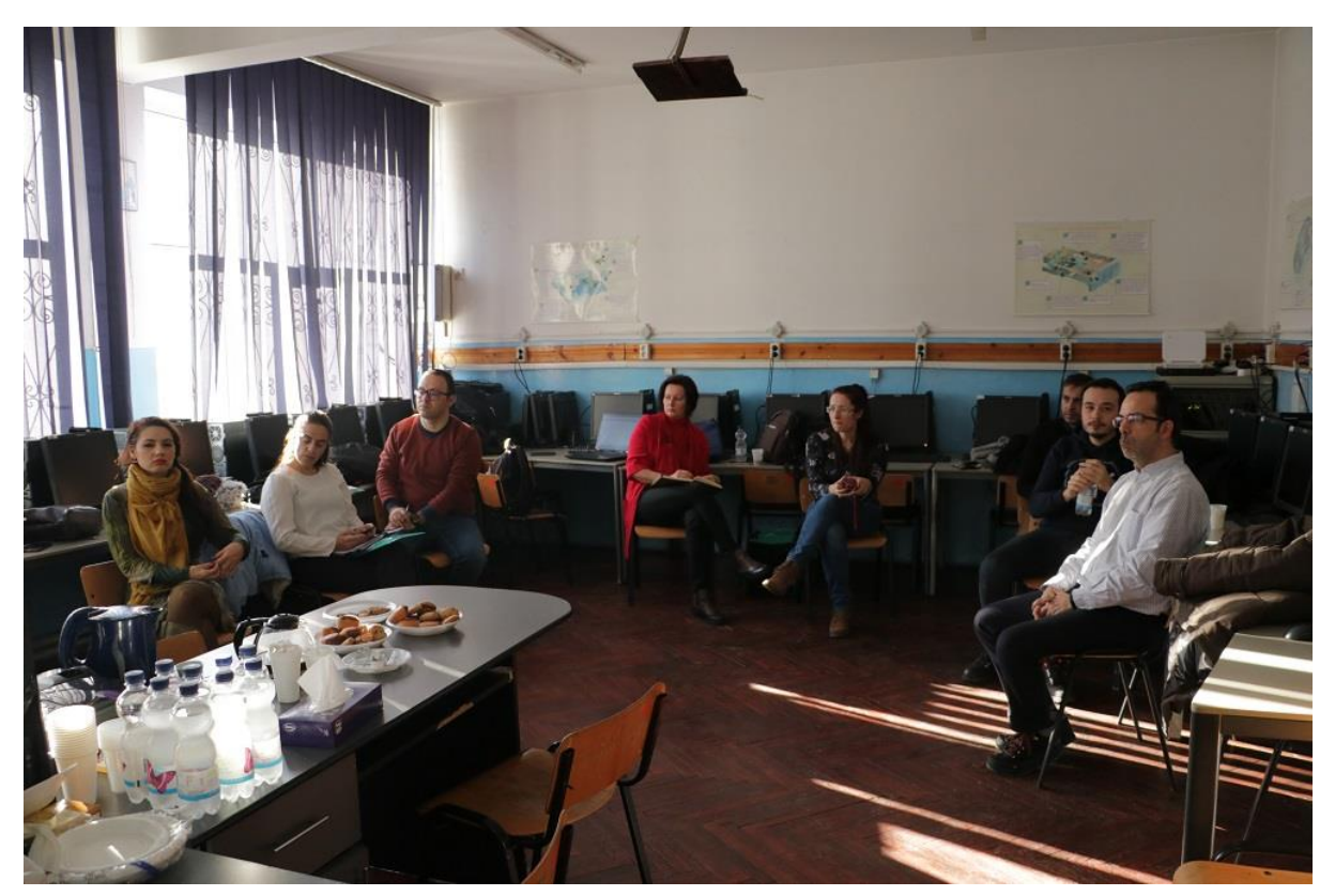
The audience during presentations