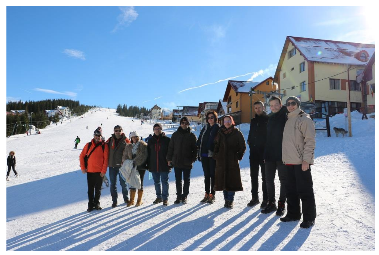
At the Ranca ski resort

That day the road to the Parang Mountains ski resort Ranca after heavy snowfall was opened and the group decided to take the opportunity to go there as it was initially planned. The resort is 60 km far from Targu Jiu in direction Novaci at the altitude of 1600 meters above sea level. The landscape looks spectacular and is worth seeing it especially in the winter conditions.