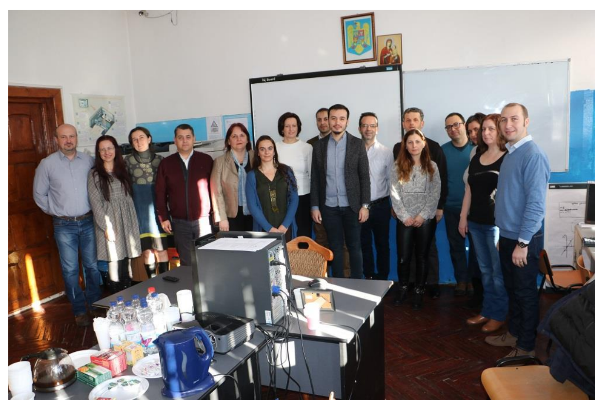
ITTP-21CS project group with the city vice mayor